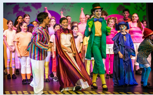
Image: HYTC Wizard of OZ' production 2023

Classes will be held at the Hawkins Theatre, if the venue needs to be changed due to theatre availability, all parents and caregivers will be notified by email, phone or text. Please make sure you help us to keep your details up to date.