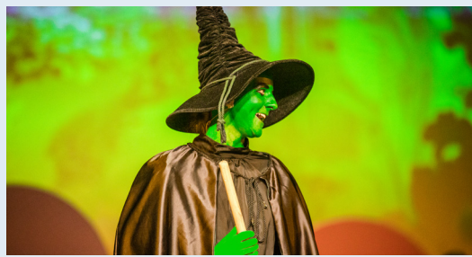
Image: HYTC Wizard of OZ' production 2023

Hawkins Youth Theatre Company is dedicated to nurturing the youth within our local community by providing them with a platform to develop their stagecraft, build their confidence, and expand their knowledge of theatre and performance in a safe, supportive, and collaborative environment.