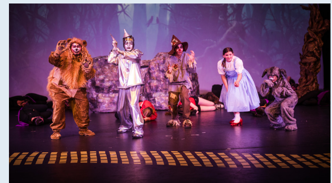
Image: HYTC Wizard of OZ' production 2023

We want to deliver to our youth diverse opportunities to perform, develop their artistic abilities and to learn the fundamentals of theatre performance and stagecraft. We will be teaching a variety of theatre based techniques from script reading to self creation and give the freedom to explore growth and share creative expressions. Our weekly classes have a duration of 60 minutes and regular attendance is expected to ensure the company develops their skills as a collective.