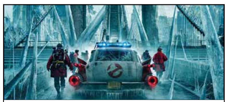
Ghostbusters: Frozen Empire (PG)