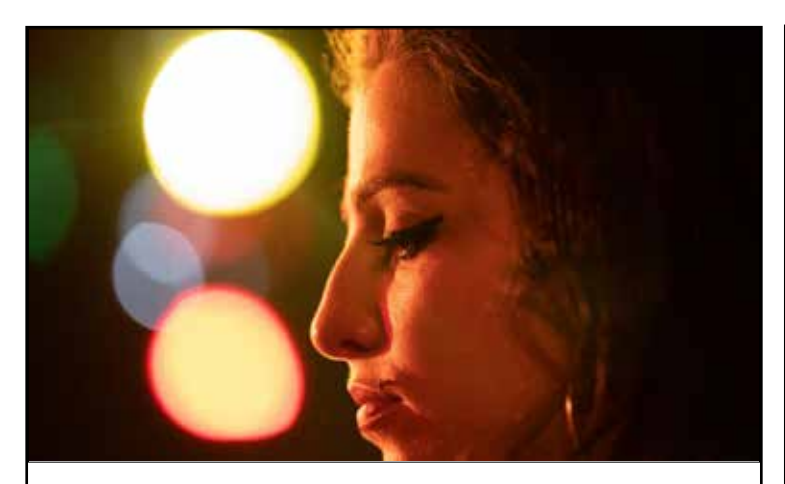
Back to Black (R13) Running Time: 122 minutes

A celebration of the most iconic – and much missed – homegrown star of the 21st century, this is extraordinary tale of Amy Winehouse .